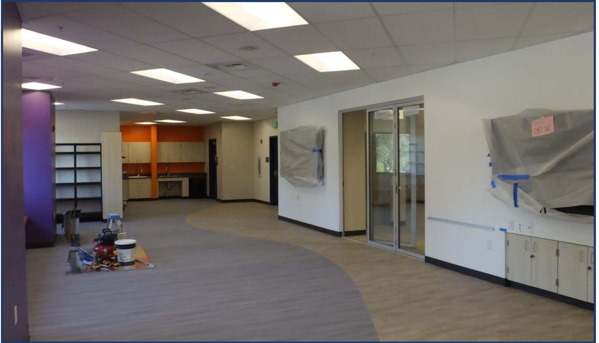
Cherrywood FIS – FIS Space Looking East