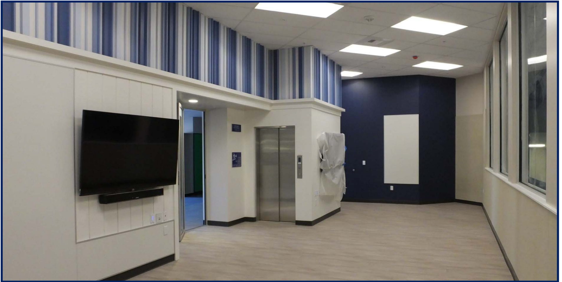
Cherrywood FIS – Front FIS Space Looking East